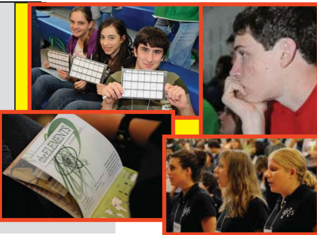
“...we are taking every thought captive to the obedience of Christ...” 2 Corinthians 12:5b